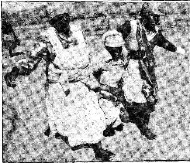
Women in South Africa help a friend, too weak to walk herself, to the voting station.