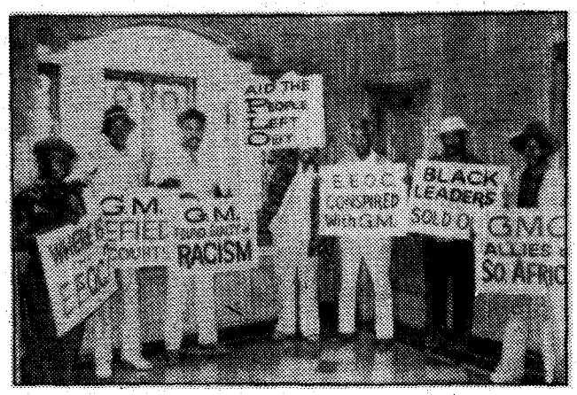
Black GM workers in Chicago protest racism and sell-

The attacks in Boston on school buses carrying