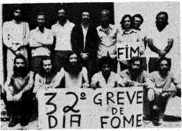
Rio de Janeiro prisoners — hunger strike ends but jail

Recife, Brazil — There have been over 100 strikes in Brazil in the last months — bus drivers, teachers, sanitation and civil service workers — all trying to get better salaries, as what they receive is not enough to pay rent, food, and transportation. Currently 200,000 metalworkers, 200,000 bank employees, 20,000 miners and 10,000 state construction workers are on strike.