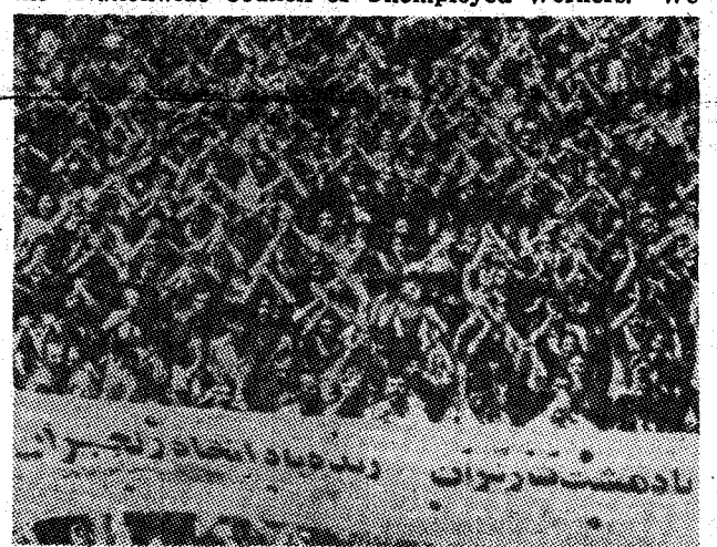
Workers clasp fists in May Day demonstration in Iran. Banner reads: "Long Live the Workers' Fist. Long Live the Unity of the Sufferers."

Tehran, Iran-The spontaneous shora(s), or soviets, which were considered "dangerous" by the government and ordered dismantled after the February revolution, are now experiencing a new growth among the Iranian masses. "Shora" is the most popular word in Iran today, because they were the real force of the revolution which overthrew the Shah. The most radical of the shora(s) is the "Nationwide Council of Unemployed Workers." We