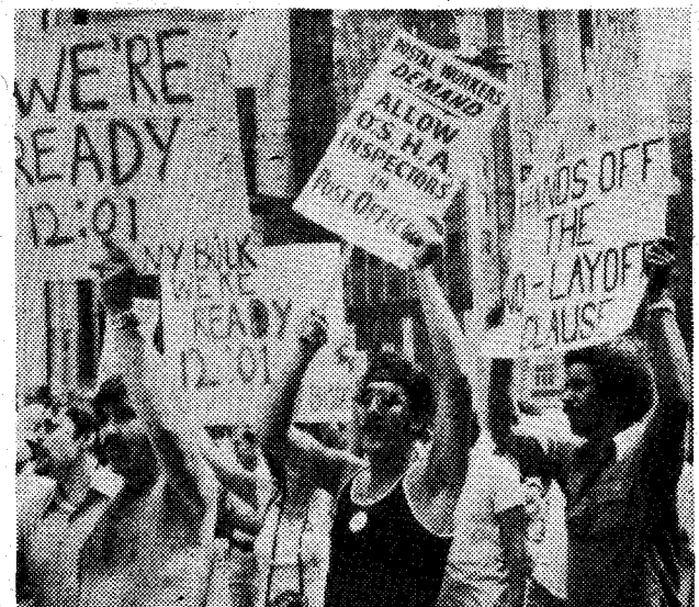
New York postal workers reflect growing spirit of rebellion. See Editorial, p. 4.

They share in common both the necessity to face electorates that can terminate their shaky regimes, and