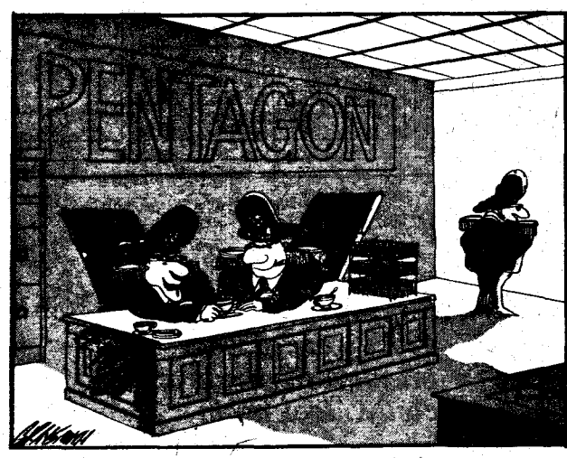
"If you can't sell human rights, sell arms."

The current bribery scandal involving U.S. Congressmen and the present U.S. fascist puppet in Korea, Park Chung Hee, far from revealing, actually hides the real crimes of U.S. imperialism against the Korean people.