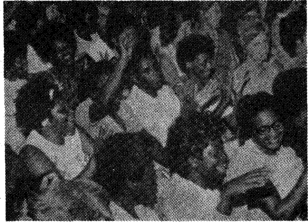
Oneita Mills workers in South Carolina, Black and white together, celebrate union recognition victory.