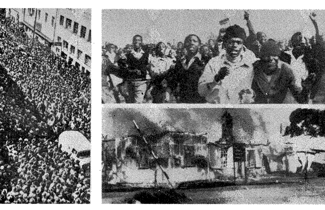
At left, over 30,000 Black South Africans massed in Capetown in 1960 to protest arrest of their leaders. Today, youth have sparked mass revolt against brutal apartheid rule. Building in flames was where apartheid documents were issued.