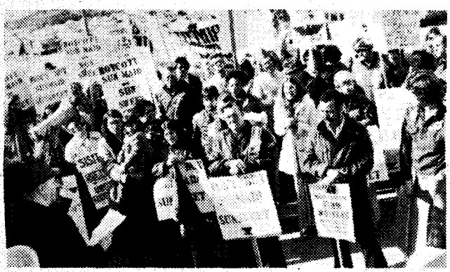
Pickets support UFW and supermarket workers

Detroit, Mich.-Strike activity of farm workers and their supporters all over the country has not ceased despite the defeat of re-funding for the election process caused by grower pressureespecially by the Sunmaid and Sunsweet cooperatives-on key California legislators.