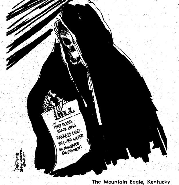
The real cost of coal

Twenty-six men were murdered at the Scotia Coal Co. No. 1 Black Mountain Mine near Oven Fork, Kentucky in two methane gas explosions. Murdered? Yes, that is what I write and feel. The night before the first explosion the company had been cited for not having the required