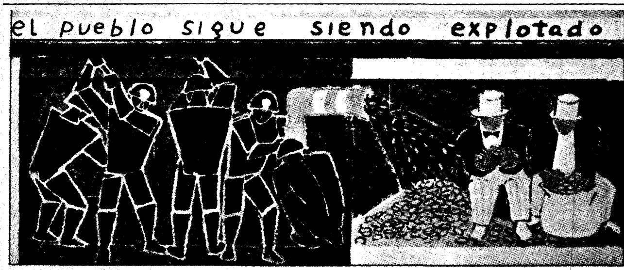
"The people continue to be exploited."