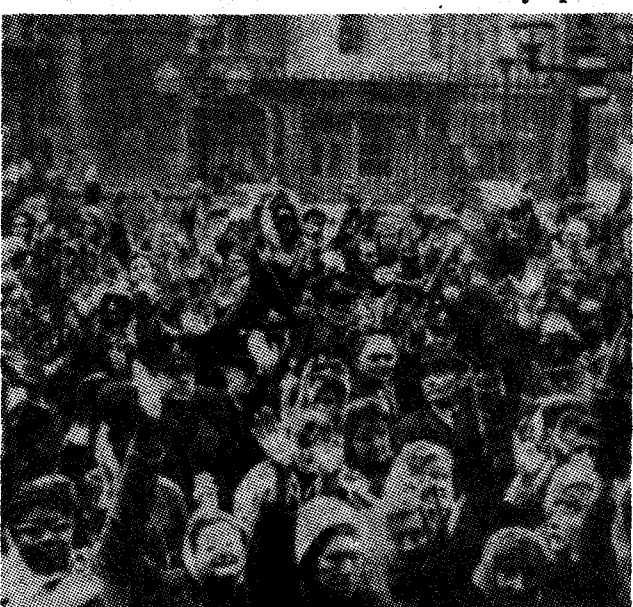
British museum workers in London join in widespread action as civil servants strike for first time in history.

Glasgow, Scotland—The wage freeze imposed late last fall by the Heath Tory government in Britain to control a disastrous inflationary spiral