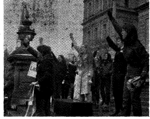
Demonstrations in Michigan for repeal of abortion laws-"Free Our Sisters, Free Ourselvés!"

The average income for women is about half that for men, and for black women it is even lower. Yet