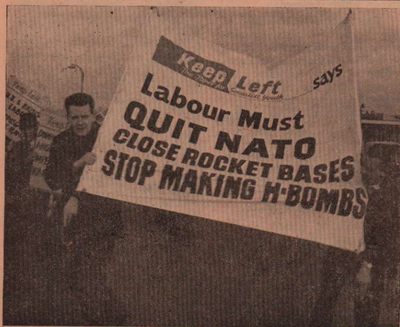
Keep Left banner on the march.

This was the fourth march. Still the great need is to bring the emphasis on the participation and struggle within the Labour movement. We must win those young people who demonstrated into the ranks of the Young Socialists and give their beliefs a political backing.