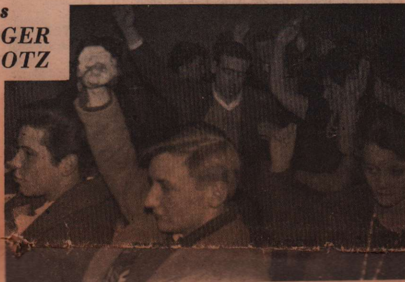
At its meeting on Friday, 28 April the 115-strong East Ham South branch voted on a resolution to sponsor Keep Left . Only one hand was raised against. East Ham is just one of the many branches to decide to support the paper since the YS Conference.

our movement should have a strong monthly paper. "New Advance" will not fill that rôle until we control it. As far as Keep Left is concerned, I stand by what I said in my statement: "I dislike some of the things you say, but I will defend your right to say them."'