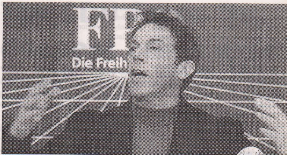
"Sure of himself, unconventional and aggressive": Jörg Haider

The opponents of this referendum were responsible for the biggest anti-racist mobilization that Austria had ever seen - 250,000 people took part. This referendum was a defeat for the FPÖ, which hoped for