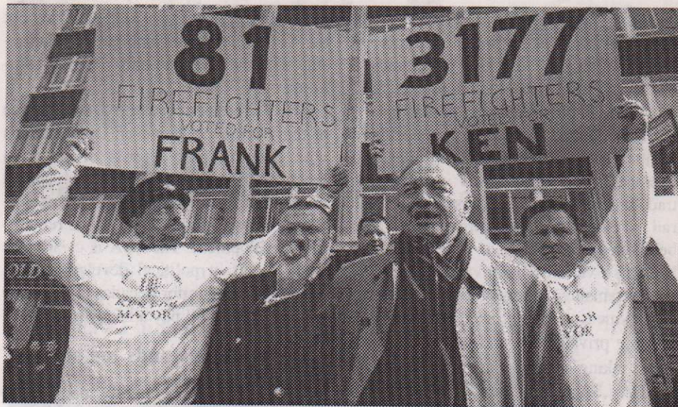
Livingstone has won support from the leftwing firefighters' union

It achieved a major breakthrough when it got Tommy Sheridan elected to the Scottish Parliament. It has just had its first annual conference and it is clear that it has made significant progress. It has emerged as a small mass centrist party. It has grown rapidly in a year from 400 members to 2,000 in 53 branches throughout Scotland - a significant left force in a population of just 6m. It gets a high media profile in Scotland and is currently registering 6% in the opinion polls, which would give three SMPs if there was an election now. But the significance of the SSP is not just in Scotland. It is seen as a model for possible similar developments in England and