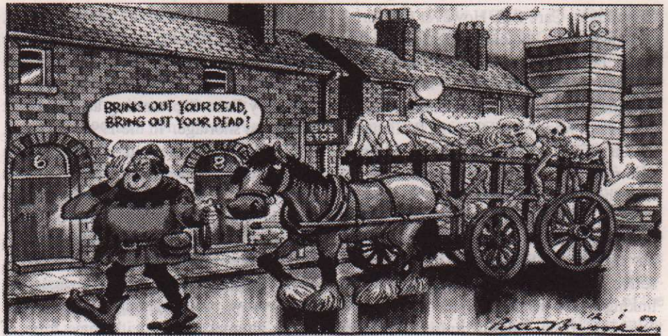
FLU CRISIS — THE NHS GEARS UP...

Early in 1989 came the long-awaited Tory plans, in a White Paper Working for Patients . The new plan relied heavily on the concept of an "internal market". The NHS would be divided into "purchasers" and "providers", with both remaining within the framework of the NHS. The main purchasers would be revamped health authorities. A second line of pur-