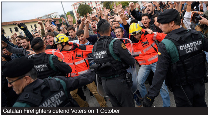
Catalan Firefighters defend Voters on 1 October

Socialists do indeed criticize Puigdemont and the bourgeois nationalist leadership of Catalonia, but we criticise from the left for their failure to mobilise the masses and really put up a fight for independence, for their willingness to compromise and even sell out the struggle, not for their daring to defy Rajoy and the