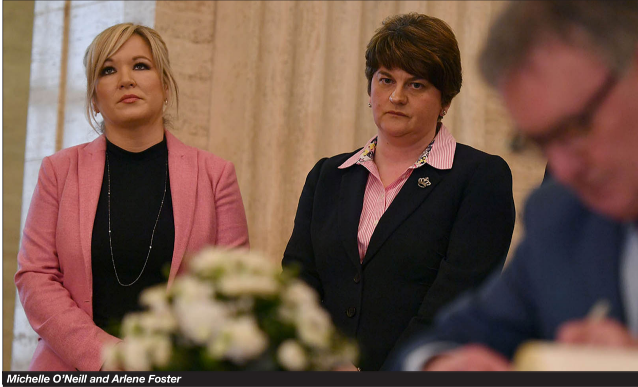
Michelle O'Neill and Arlene Foster

That said, Sinn Fein's equality demands don't go anywhere near far enough.