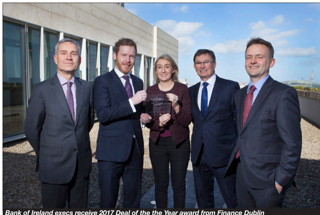
Bank of Ireland execs receive 2017 Deal of the Year award from Finance Dublin