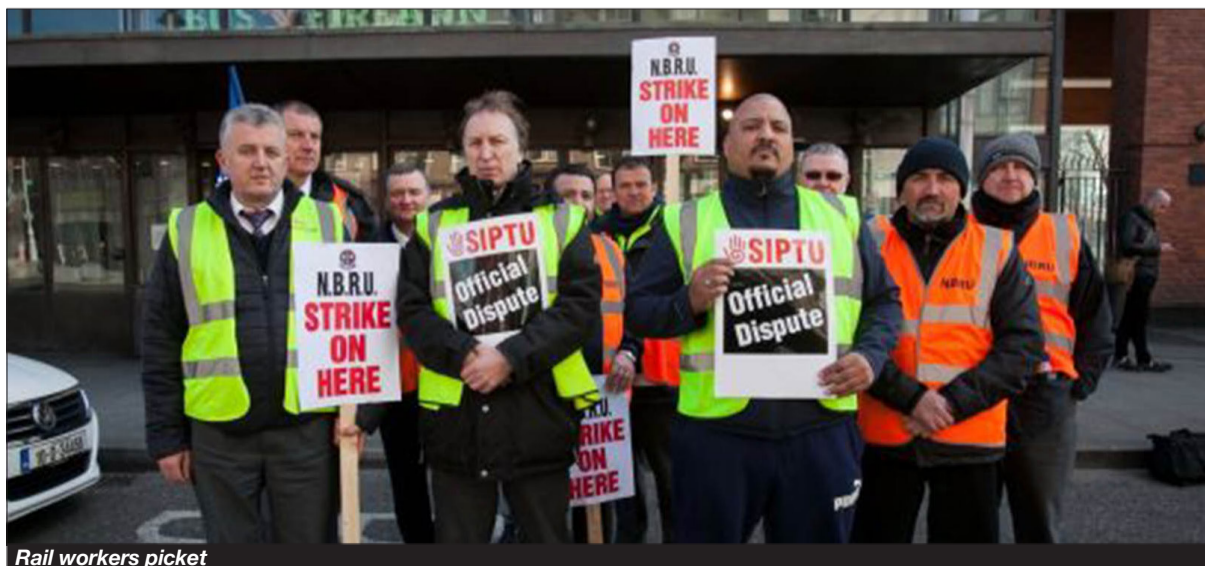
Rail workers picket

cut in subvention between 2008 and 2015. If the company funding