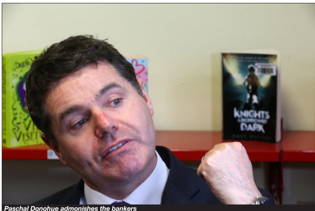
Paschal Donohue admonishes the bankers