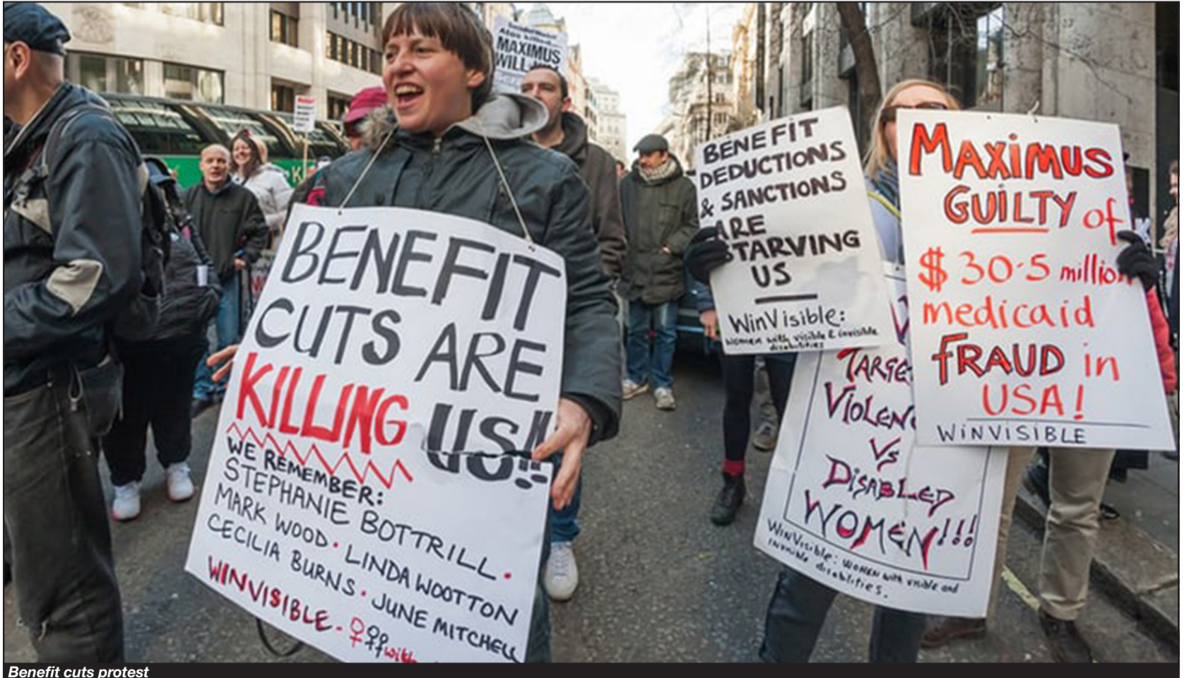
Benefit cuts protest

People living with disabilities will be among the hardest hit by welfare