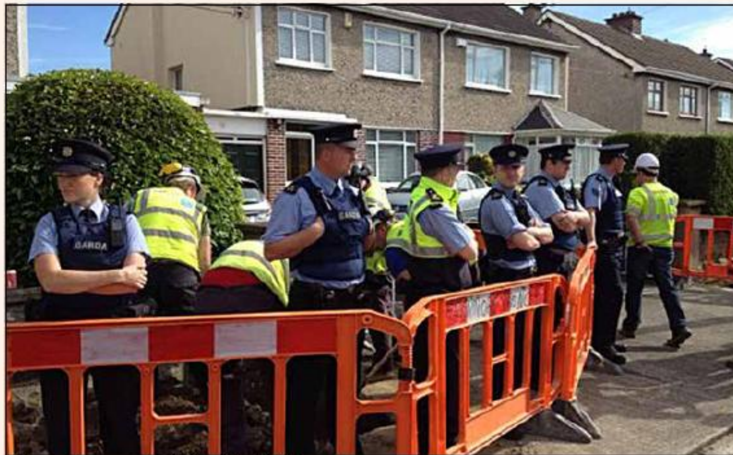
Police protect water meters in Tonleeg Drive (Dublin)

will get you just one five-minute shower, two brushes of your teeth with the water running and one flush of the toilet per day before you pay the full cost.