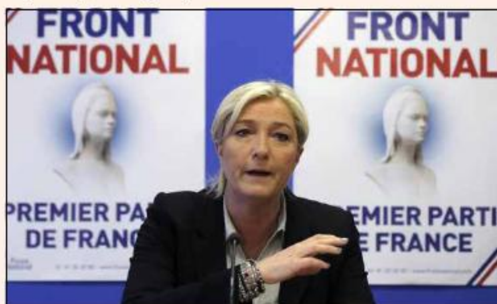
Marine Le Pen leader of the openly racist Front National, who topped the polls in the latest French EU elections

This helps to explain why they have been