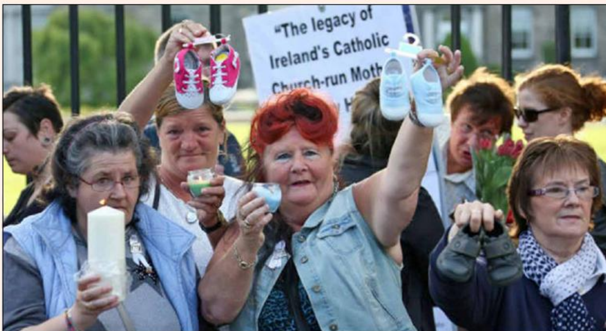
Women gather outside the Dail to show their disgust at the treatment of Mothers and Babies in Tuam Bon Secours bell bole

In 1944, two hundred and seventy one children lived in the Tuam mother and baby home. Sixty one of the residents