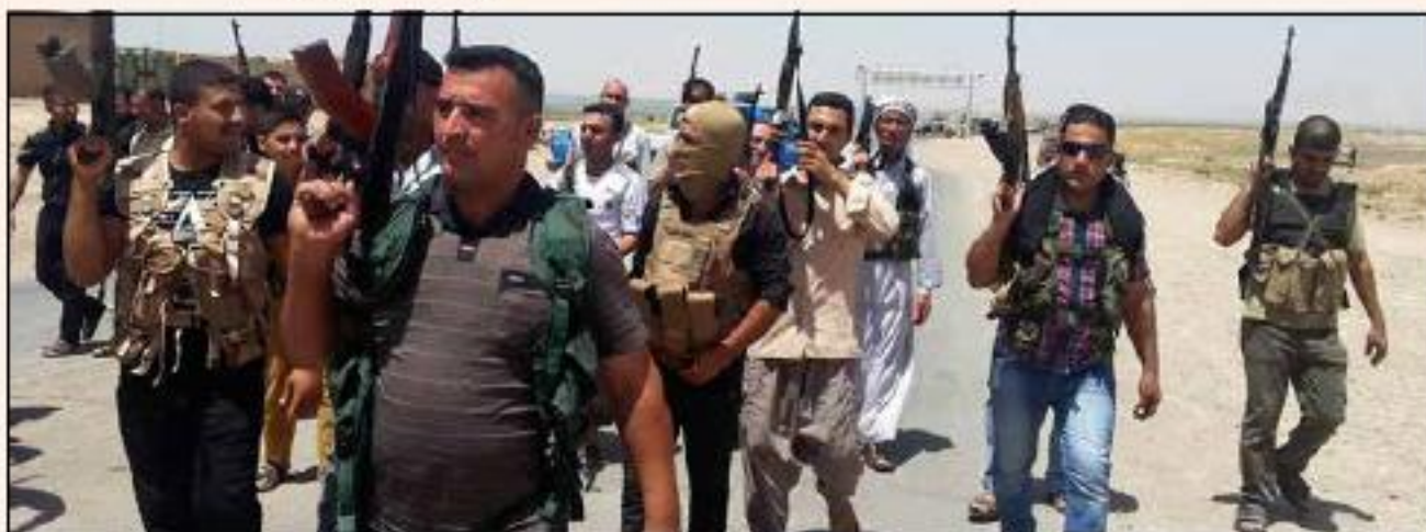
Shia militia leave Baghdad on their way to fight Isis insurgents

At the time, the US and its coalition allies sought to engineer sectarian tensions to divide a growing national liberation movement.