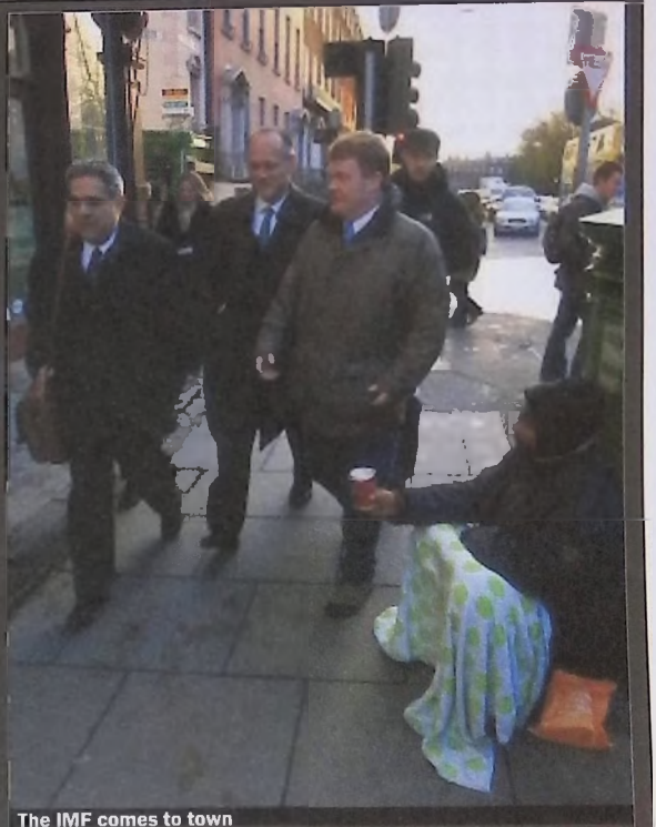
The IMF comes to town

THE IMF has urged the government to launch an all-out war on people who receive social protection payments.