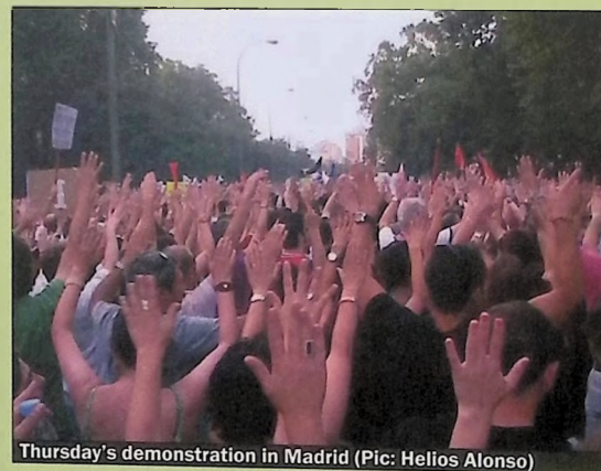
Thursday's demonstration in Madrid

They are protesting against a cuts programme that amounts to a Spanish version of the "shock therapy" inflicted on