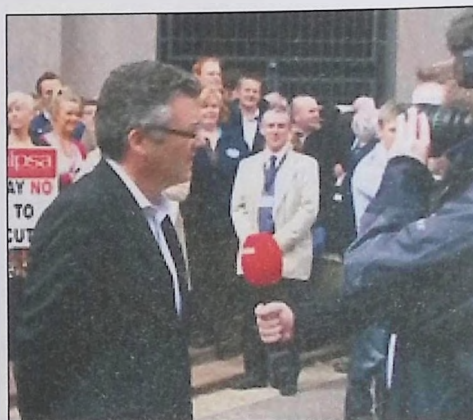
In recent days the Trust has signalled that they are not prepared to negotiate further to

NIPSA members employed by the South Eastern Health and Social Care Trust as Night Shift Supervisors have been on all out strike since 18 June 2012 over a dispute in relation to an unacceptable change to their shift rota.