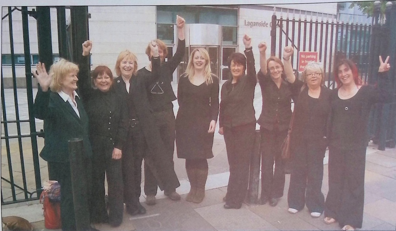
The Raytheon Nine outside the Laganside Court after their acquittal