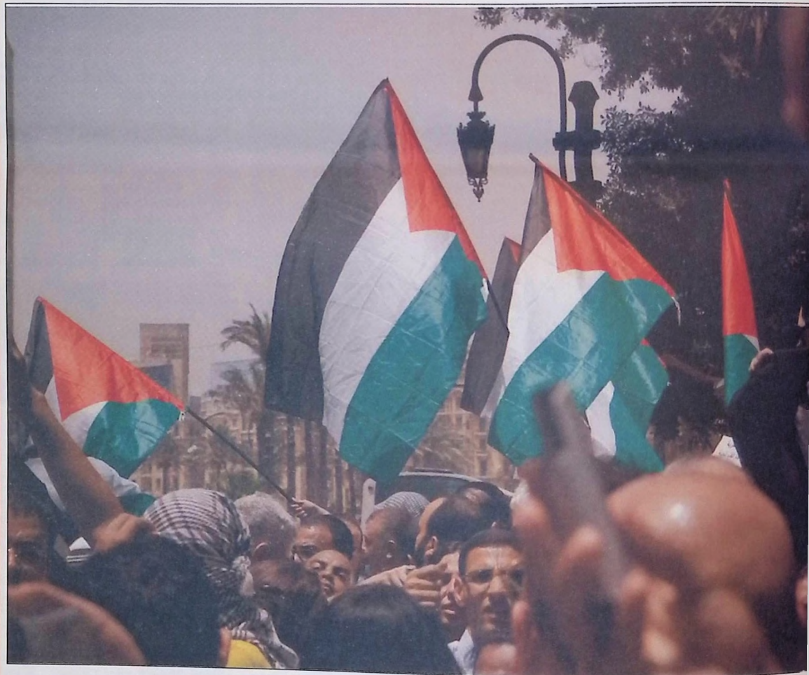
The road to Jerusalem passes through Cairo

Hossam el-Hamalawy, an Egyptian socialist and journalist discusses the im-