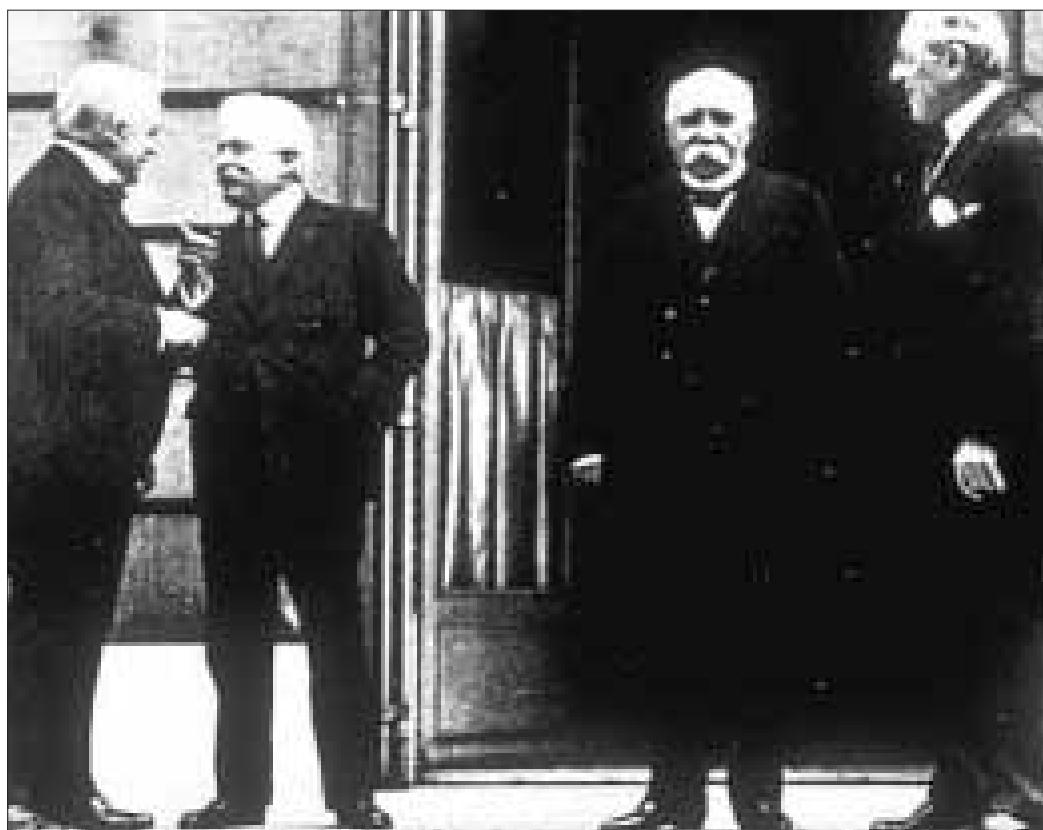
■ Lloyd George, Orlando, Clemenceau and Wilson: The leaders of the Great Powers plan out the carve up of the world following the First World War. Below: Abdul Karim Qassim

The U.S. and the U.K. have been surprised by the level of resistance they have met in Iraq. Instead of being greeted as liberators, they are being fought against as invaders.