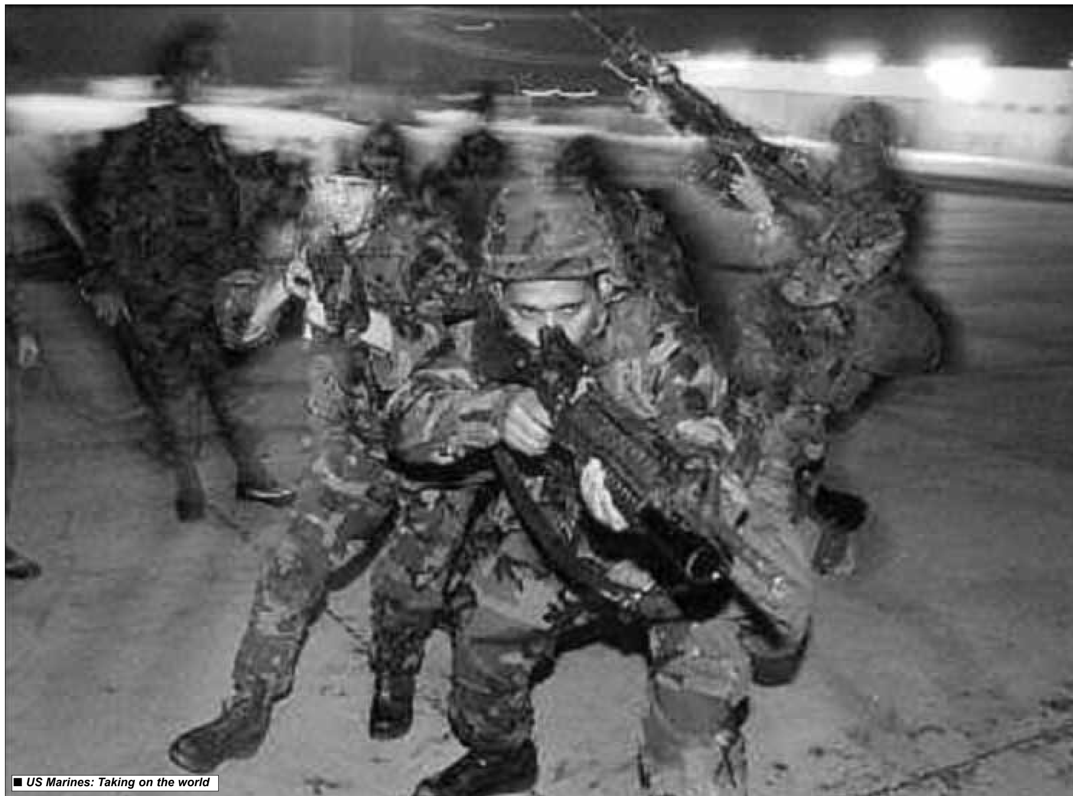
■ US Marines: Taking on the world

In 1997 William Kristol explained why the US should expand NATO into Eastern Europe: "An American-led NATO prevented Moscow from accomplishing its goal.