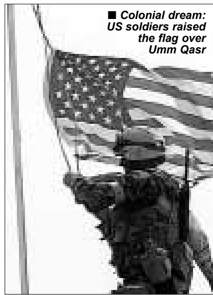
■ Colonial dream: US soldiers raised the flag over Umm Qasr

"By placing Poland, Hungary and the Czech Republic under NATO's security umbrella today, NATO can deter any rising power from aspiring to that goal in the