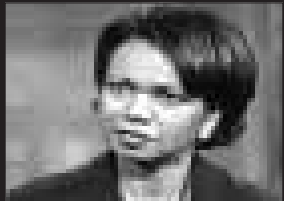
■ Condoleezza Rice

The Israeli government includes the far right National Religious Party which advocates the “transfer”-ethnic cleansing-of the Palestinian people from their homes in the Occupied Territories.