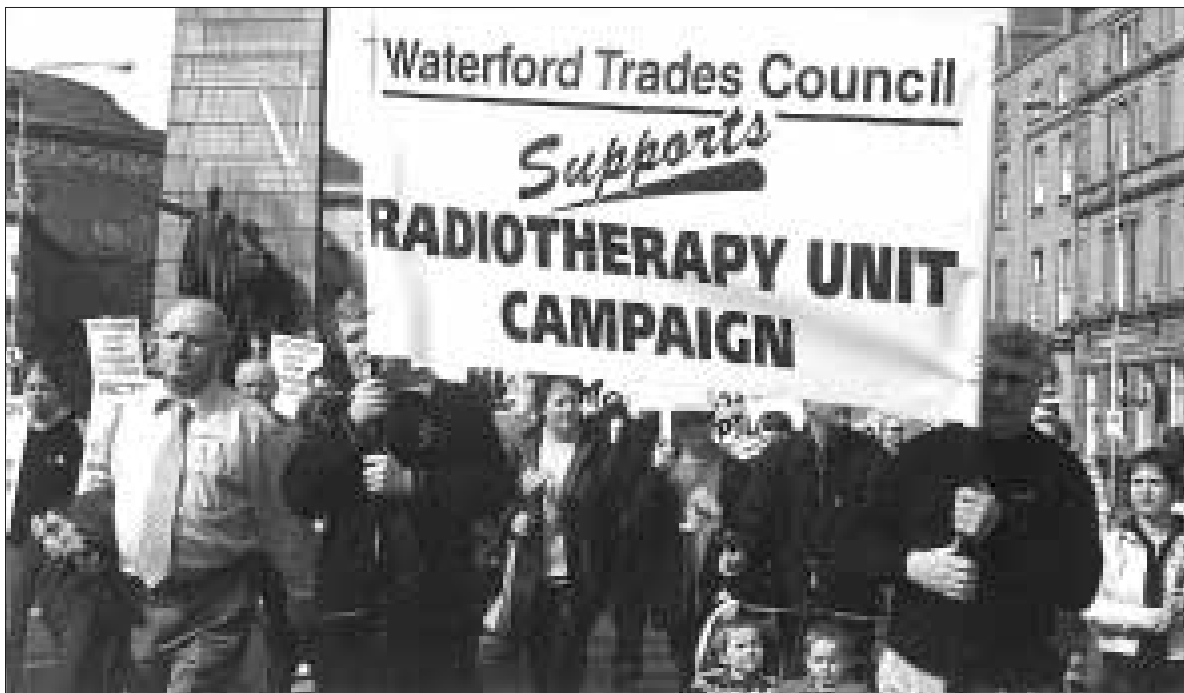
■ Last Saturday's protest in Dublin

Carrying a "Health care not Warfare" placard one man said "It sums up how obscene the priorities of this world are at the moment. I hope Bertie Ahern is listening. He should pay a bit more attention to serving the people who elected him and less time sucking up to George Bush"