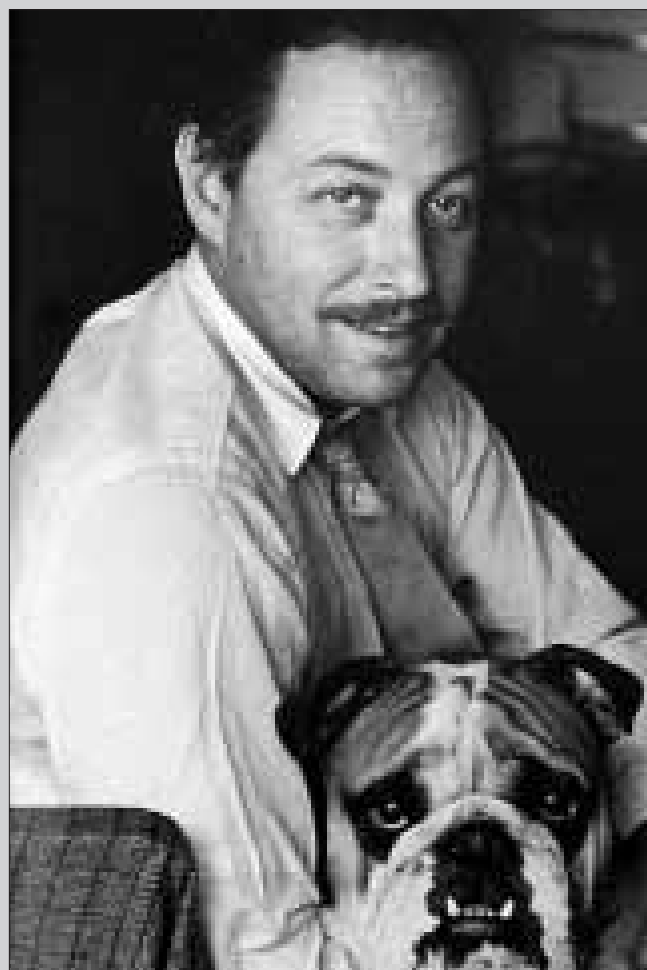
■ Tennessee Williams in 1954