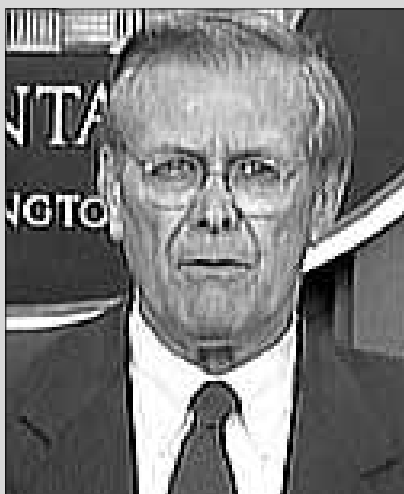
■ Rumsfeld: Plotted to attack Iraq

including Hasbro, a major investor in sweatshop factories across Asia.