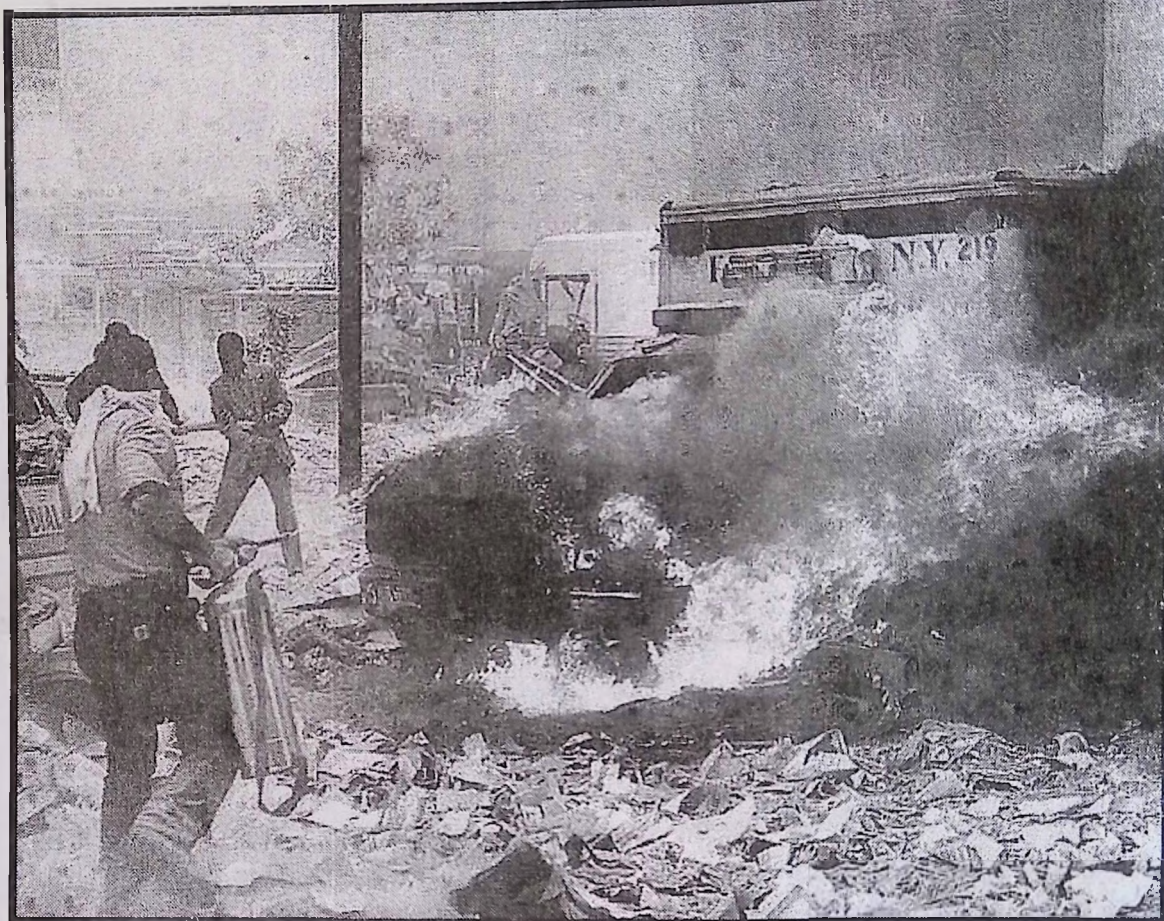
Devastation in the US

Trotsky wrote, "A strike, even of modest size, has social consequences—the