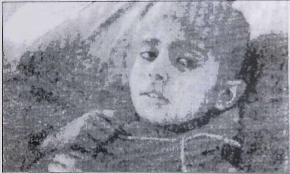
Half a million Iraqi children have already died from the effects of sanctions

WESTERN sanctions since the last Gulf War have killed far more people than Saddam Hussein.