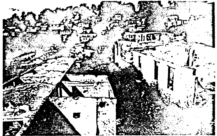
ISRAEL AND THE UNITED STATES

culture. THE PROFITS BUY GUNS, PLANES AND BOMBS WHICH KILL PALESTINIAN, ARAB AND AFRICAN PEOPLES.