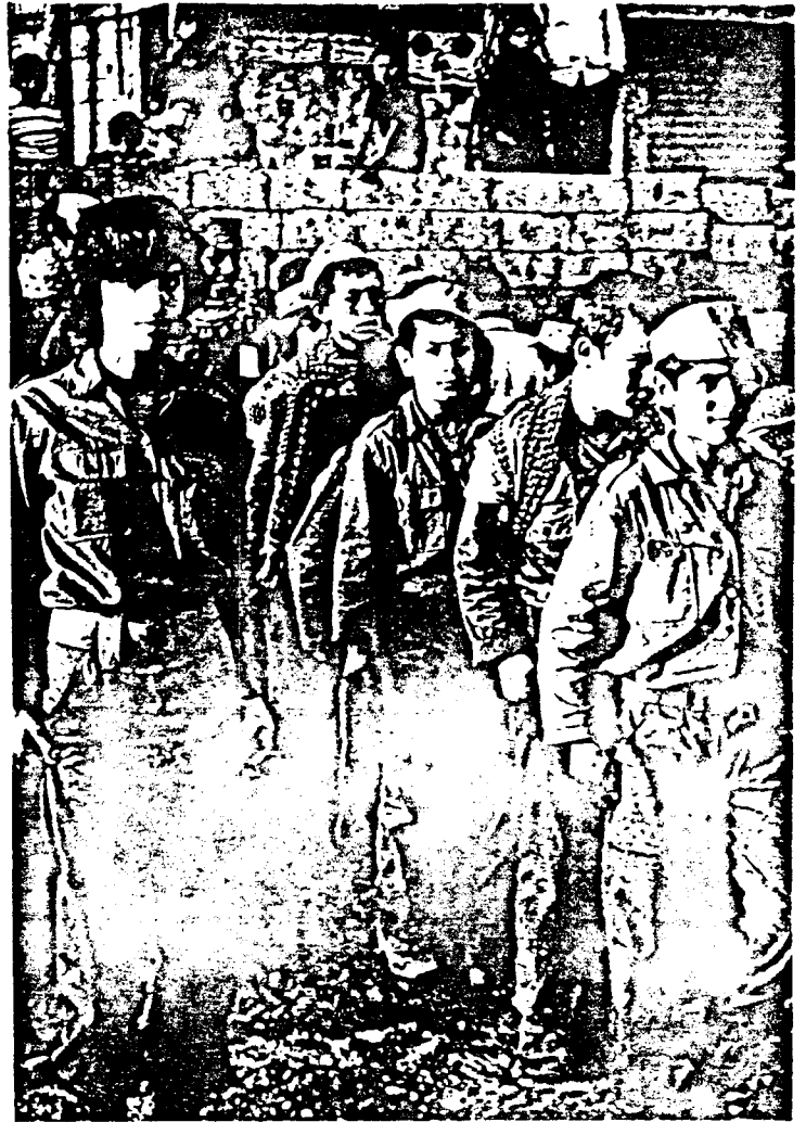
Palestinian youths in military training in Sabra refugee camp in Beirut, Lebanon.

For more information contact A-APRP Box 3307 Washington, D.C. 20009 (202) 387-8996