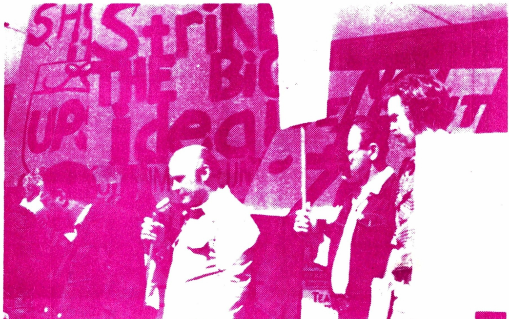
TDC Day of Action—March 13th. Over 400 demonstrate in the Bay Area. Over 2100 Teamsters took part nationally.