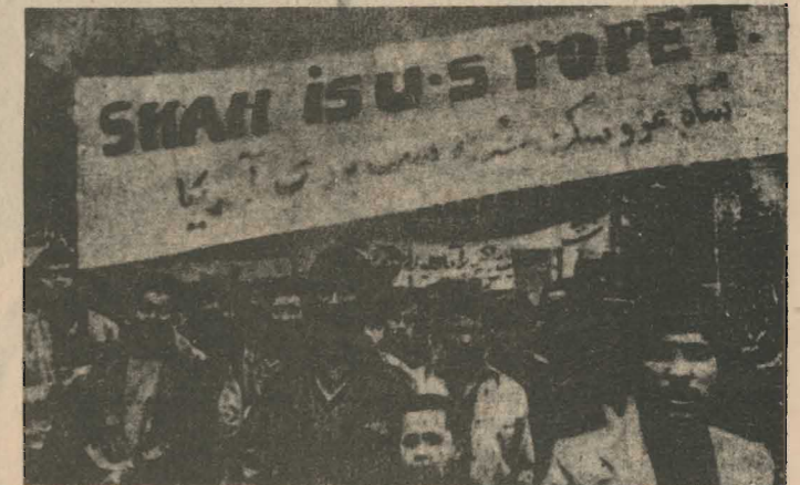
Photo shows a portion of the hundreds of thousands of anti-Shah demonstrators marching through the city of Tehran, demanding the overthrow of the bloodthirsty regime of the Shah and its U.S. imperialist masters. In the past year, these demonstrations have been characterized by the fascist violence of the Shah's police forces, resulting in the murder of tens of thousands of Iranian people.

perialism and its servants are making every effort to save the day for themselves in Iran through every sort of maneuver aimed at liquidating the people's struggle for genuine national and social liberation.