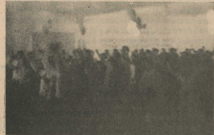
Militant support for Socialist Albania in Chicago

Last month the Central Organization of U.S. Marxist-Leninists carried out a vigorous campaign to hail the 34th anniversary of the complete liberation of Albania. With revolutionary enthusiasm for the People's Socialist Republic of Albania, over 500 people attended the meetings which were held in Boston, Chicago, New York, Oakland and Seattle. The entire campaign was permeated with the basic theme to learn from and defend Albania, the bastion of socialism and world revolution. The campaign was organized under the slogans: "Glory to Albania, beacon of socialism!", "Denounce the hostile acts of the Chinese revisionists against socialism in Albania!", "Uphold Marxism-Leninism in struggle against the 'three worlds' theory and all revisionism and opportunism!", "Hail the Party of Labor of Albania, organizer of the victories of the Albanian people!". A full report on this revolutionary campaign in support of socialism will be carried in the next issue of The Workers' Advocate .