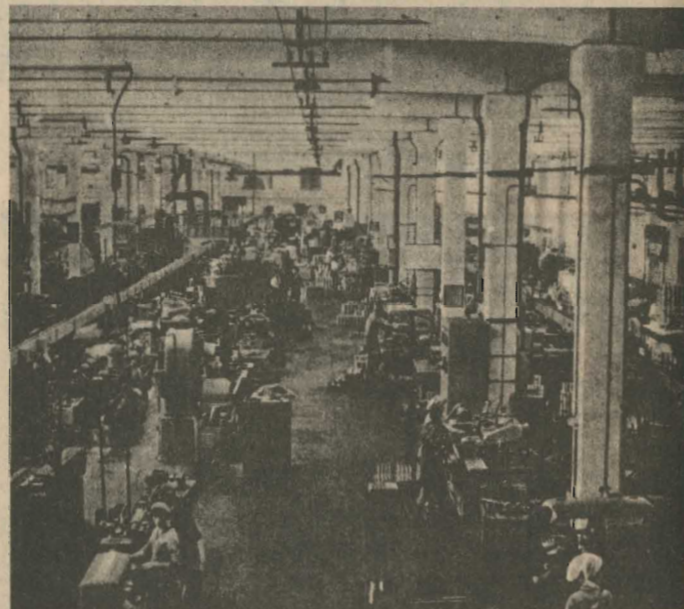
Photo shows the interior of the "Tractor" plant, part of the newly-inaugurated "Enver Hoxha Automobile-Tractor Combine" in Tirana. The combine was inaugurated with a joyous celebration, which also included the inauguration of the first Albanian-made tractor, on October 14. This marks another great victory of the correct Marxist-Leninist policy of the glorious PLA which is consistently implementing the Leninist principle in the construction of socialism, relying on the forces of the Albanian people themselves, and overcoming all obstacles, including those created by the Chinese revisionists.

This is only the briefest outline of the new life being created in Albania. In the U.S. of course, there is an entirely different story. The U.S. monopoly capitalist system is deeply mired in all-round economic, political and cultural crisis and decay. The bourgeoisie is shifting the burden of this crisis onto the shoulders of the proletariat through ever-intensified capitalist exploitation. Mass layoffs and unemployment alongside soaring inflation and decreasing real wages are what the working class has to constantly face. But the workers do not agree with