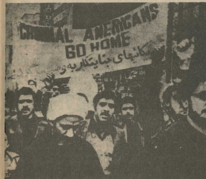
The fighting people of Iran are continuing their revolt against the fascist Pahlavi regime. The bloodthirsty violence of the regime's forces is showing the people of Iran that the old social order in Iran can only be overthrown through armed struggle.