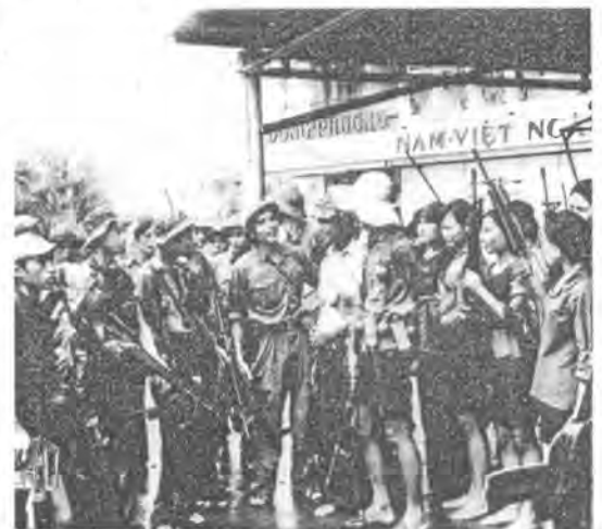
The heroic militia of Hue meeting liberation fighters in order to discuss new tasks.

"Our compatriots in the North and South will be reunited under the same roof. Our country will have the remarkable honour of being a small country which in a heroic combat defeated two great imperialist powers - the French and the American - and made a worthy contribution towards the national liberation movement."