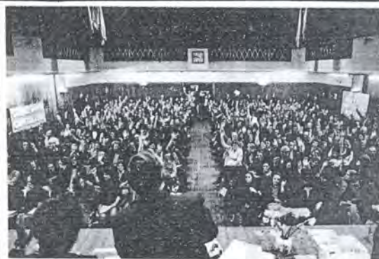
May Day meeting of the CPB(ML) at Conway Hall

Our fight against the Common Market is on political not economic grounds. We make no