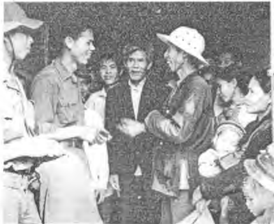
People of Da Nang greeting members of the Liberation Army who have freed the city.

The legacy of Vietnam will be with us for many years to come.