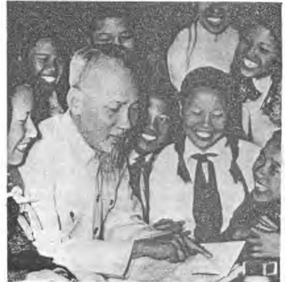
May 19th is the birthday of Ho Chi Minh whose leadership insured the complete victory of the Vietnamese people he did not live to see.

British General Douglas Gracey took the Japanese surrender in Vietnam at the end of the Second World War. Of the Vietnamese communists who had done the bulk of the fighting against the Japanese and who came to him seeking co-operation he says: "They said welcome and all that sort of thing. It was an unpleasant situation and I kicked them out." Thus the way was cleared for the French to take over Indo-China again.