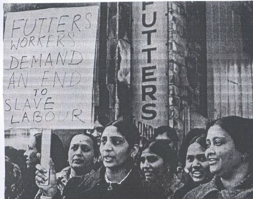
SOME 60 workers, mainly Asian, on March 23 walked out of their Harlesden factory, Futters (London), on a half day strike to protest against pay and conditions and to demand union recognition.

A WEALTH TAX and the ending of fee-paying schools have been in almost every Labour Party manifesto since the War and yet there are just as many wealthy people and fee-paying schools as ever. Perhaps the best way of saving Dunlops, Corby and other industries under threat of closure would be to get the Labour Party to promise in its manifesto to put an end to them.