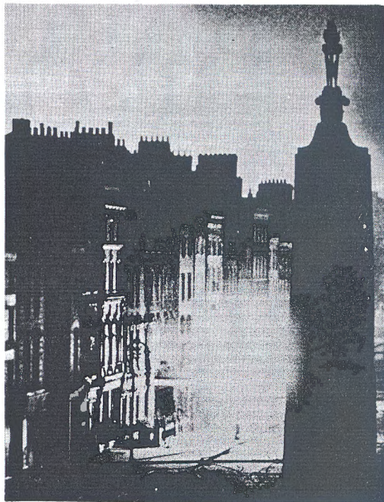
Sackville Street, Dublin, 1916, scene of fierce fighting 1921 when again rebellion was defeated and Ireland divided.

The rebellion failed through betrayal and failure to act. There was no party like the Bolshevik party in Ireland and no similar support. A civil war raged until