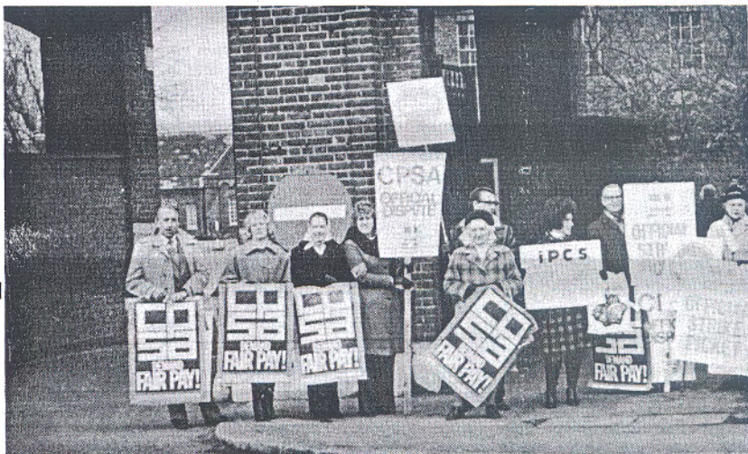
Civil servants picketing Ministry of Defence establishments - Woolwich Arsenal on April 2

Voting top of the agenda a motion calling for no class to be larger than 25, shows the concern of the profession for this issue. Agreement to this would signal a major advance not only for education but for