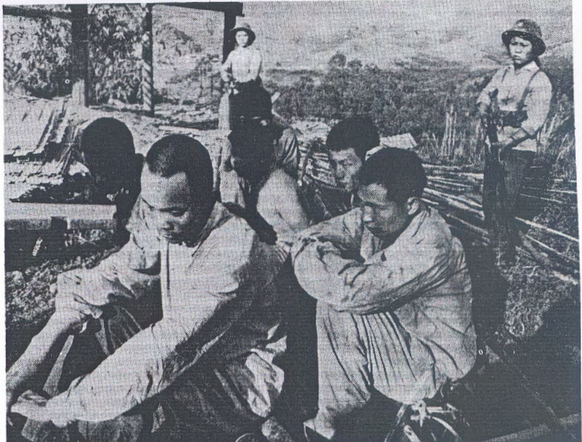
Chinese prisoners of war captured in Cao Bang during China's aggressive war against Vietnam. What a change from the time when China's liberation army represented a force for people's freedom!

express my accord with your policies as outlined in THE WORKER. The booklet by Enver Hoxha on Yugoslav Self Administration theory was informative and revealing. You have convinced me of the futility of voting. False friends are enemies, there is no real destination, Yours Sincerely, An 87 year old WORKER reader.