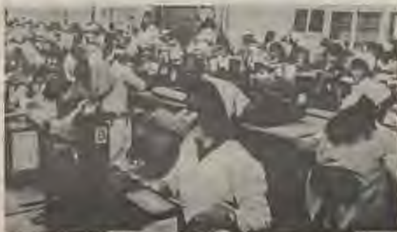
President Park of South Korea, a fascist, is with the help of U.S. troops and money is trying to hold back the smashing of his Lon Nol like puppet regime. Scores of people have been jailed and killed by Park while he talks about economic "miracles". "Runway shops" show how military and economic interests are tied together. Shops run away to South Korea where people make $18 a week slaving for U.S. corporations.

Park Chung Hee's attempt to fool the people & divert their attention from his reactionary rule because of the threat of "invasion from North Korea" has miserably failed. Park introduced a so-called "emergency measure no. 9" really aimed at suppressing the struggles of the people. He announced his intention to give students military training & forced the Korean people to take part in so-called mobilization rallies to defeat the Communists. Actually it was an effort to justify the intensified fascist repression in an effort to maintain reactionary rule & keep Korea divided forever. But actually the students & other groups who have been struggling & demonstrating have won the support of all the people. And only served to make the people see more clearly that unless Park's fascist rule is overthrown & smashed, there will be no democratic freedom & reunification of Korea.