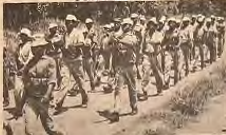
Mozambique declares independence while Zimbabwe continues to struggle to liberate Southern Afrika from white minority regimes of South Afrika and Zimbabwe (Rhodesia).