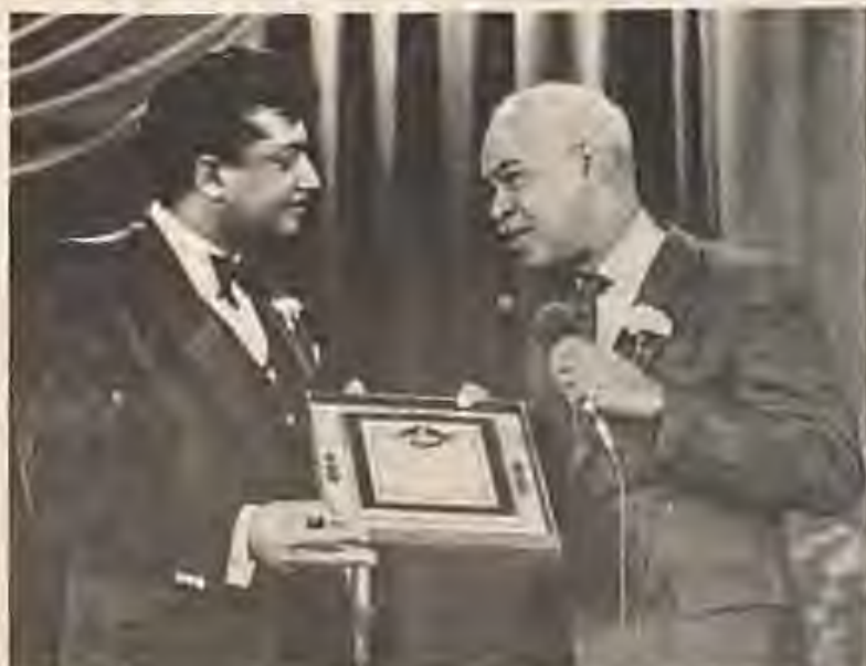
"In the work among the Negroes, special attention should be paid to the role played by the churches, and preachers who are acting on behalf of American imperialism. The Party must conduct a continuous and carefully worked out campaign among the Negro masses, sharpened primarily against the preachers and the churchmen, who are the agents of the oppressors of the Negro race."