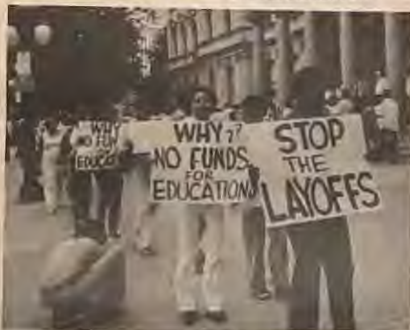
Newark workers face budget cuts and layoffs and the Board of Education will fill a $14 million budget gap by cutting out most music, art, language and recreational programs from student curriculum. Mass demonstrations in Trenton against the budget cuts were held to expose the state legislature and the governor as tools of the rich and racist mounted interest in New Jersey, instead of working people in cities like Newark. All over the country the capitalists have cut budgets on services to the people, while they make obscene profits at our expense.

DEMAND AND STRUGGLE TO GET AN ELECTED SCHOOL BOARD. STOP THE LAYOFFS. STOP THE BUDGET CUTS.