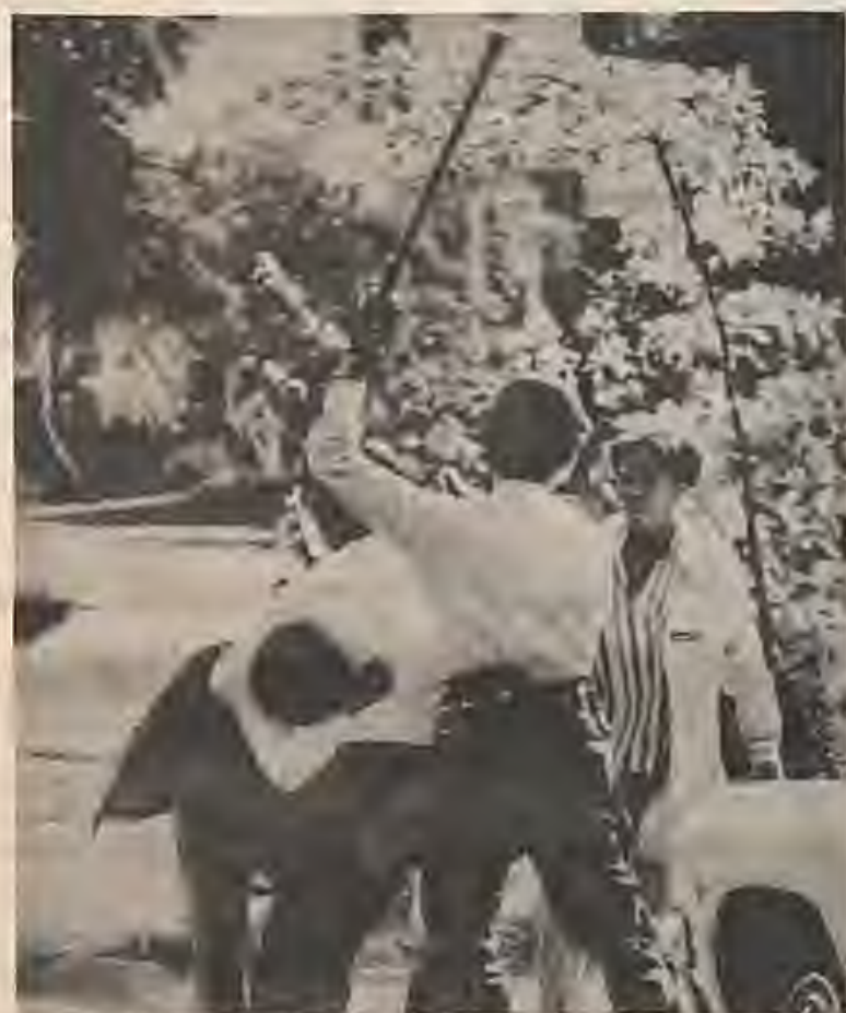
According to Ford, the S-1 Crime Bill will insure the U.S. has "domestic tranquility" which really means legalization of increased fascist repression and brutality of Blacks and other oppressed nationalities and the suppression of radicals, namely socialists.