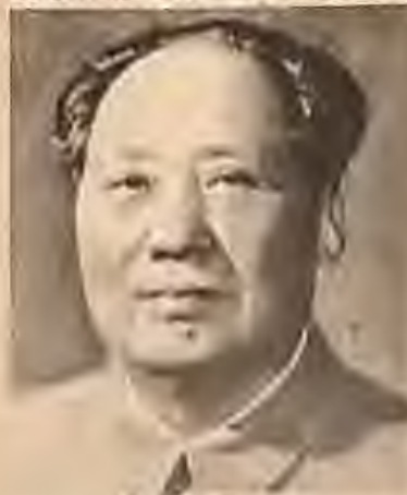
Mao Tse Tung

Chairman, Central Committee, People's Republic of China.