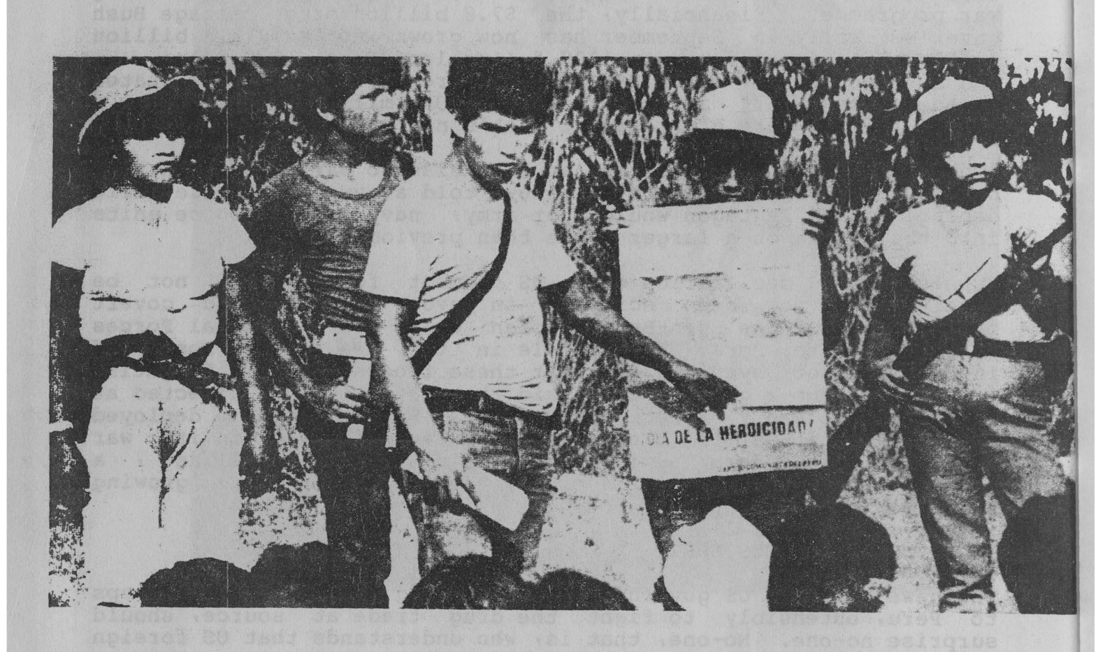
Guerrilla fighters of the PCP carry out propaganda work among the people in the countryside

"Time" magazine remarks: "The military aspects of the plan, however, are stirring the most misgivings. To fulfil Bush's campaign promise more and heavier US weapons would have to be dispatched to Colombia, and more arms and men to Peru and Bolivia." The same article notes that "Peruvian military leaders are desperate to turn back sendero guerrillas."I will take help from anyone who offers it" says a top Peruvian officer. In fact, contingents of American Green Berets have already been sent to Peru and Bolivia to train anti-narcotics police units in countersubversion and jungle warfare." The US might find, however, that it is easier to talk about suppressing people's war than to do it, as they found to their cost in Vietnam.