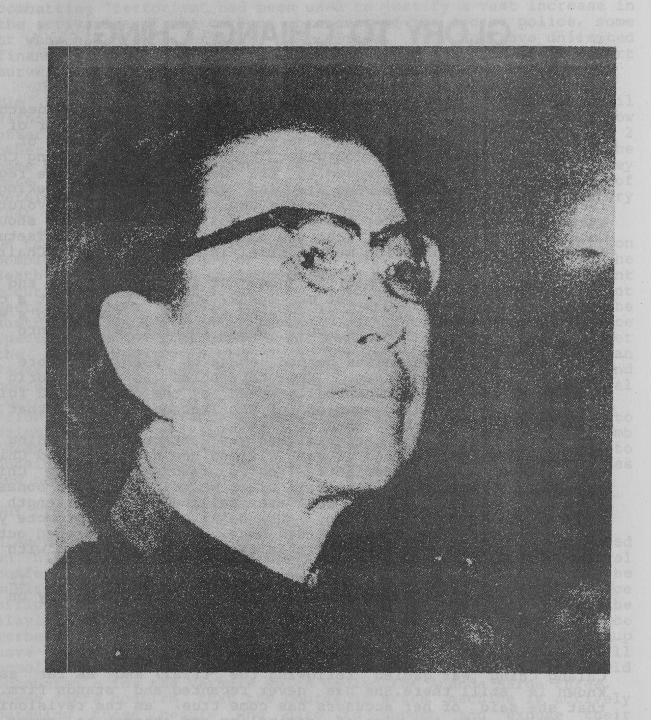
COMRADE CHIANG CHING, OUTSTANDING REVOLUTIONARY LEADER AND FIGHTER.

not process. If people such as reas of reprinting These and the Creatian Six can be gabled to years on trumped-up charges harassed and bounded while the total work paop in store to the revolutionaries who aim to overthrow the close rotten system?