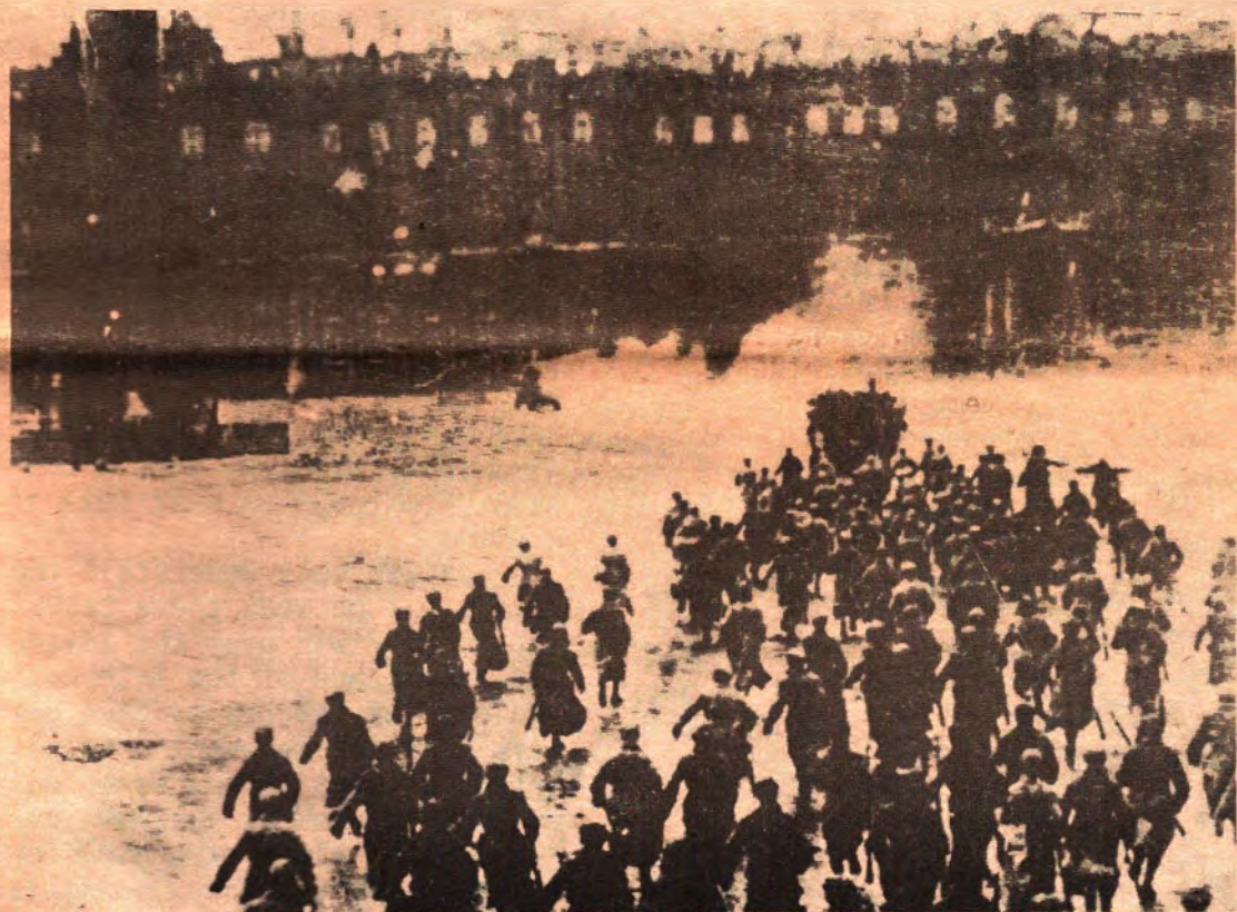
Following two truckloads of their comrades, Bolshevik soldiers dash across Petrograd's Palace Square during their successful November 7, 1917, attack on the Winter Palace headquarters of the Provisional Government

like breaking, terrorism and even mass killings of one nationality by another. We often hear in our country that, "we'll always have racism—it's human nature", or "there'll always be prejudice." The people of the Soviet Union have shown us otherwise — that once nations are free from oppression, that once national privileges are abolished--- that the material interests of the workers leads them to work and prosper in equality and harmony. Once the workers of this country, and particularly the Anglo-American workers, forge their alliance with the Asian-American, Afro-American, Chicano, Puerto Rican, Mexicano and native American peoples, they will end national oppression once and for all. They will do this by smashing the evil system of capitalism and replacing it with the planned and rational socialist system. They will stand as free people, willingly fighting shoulder to shoulder with the working class to build a free, democratic socialist society where the only people who get oppressed are rich exploiters