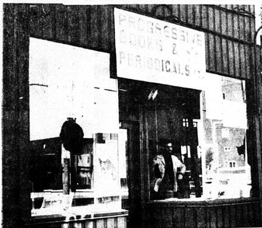
Halifax, November 2 - Comrade Glick, a staunch proletarian fighter, has vowed to resist all cowardly fascist attacks and threats.