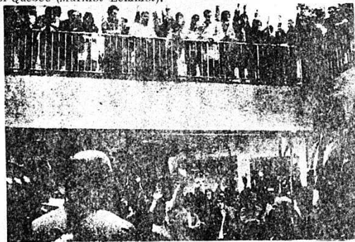
Autumn, 1969: The first attack in Halifax on the democratic right to disseminate MAO TSETUNG THOUGHT was made by Dalhousie University Administration flunkies from the Student Council. Mass democracy was unleashed by the masses in retaliation and this first bureaucratic attempt to deprive the masses of their rights met total failure.