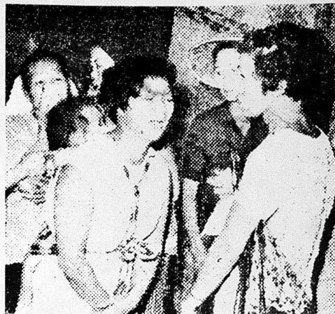
Under the rule of U.S. imperialism and the Chiang bandit gang, the life and safety of the labouring people are under constant threat. Grief-stricken family members of the dead crying at the pithead, following an explosion in the Juthan Coal Mine in Taipei.

Inveterate hatred for the U.S.-Chiang bandit gang, boundless love for the great leader Chairman Mao and longing for the mainland of the motherland are the source of strength for the Taiwan compatriots in their valiant struggle against the U.S.-Chiang reactionaries. Wholeheartedly condemning the fascist atrocities of the U.S.-Chiang bandit clique, Taiwan compatriots who had broken through the U.S.-Chiang blockade and returned to the mainland of the motherland told how many families in Taiwan asked their lives to listen to broadcasts from Peking behind closed doors and windows at night, keeping the volume down to the minimum. When they heard the music of The East Is Red , they would cheer from the bottom of their hearts in a low voice: "Long live Chairman Mao! A long life to Chairman Mao!" Many people learnt such revolutionary songs as The East Is Red and Sailing the Seas