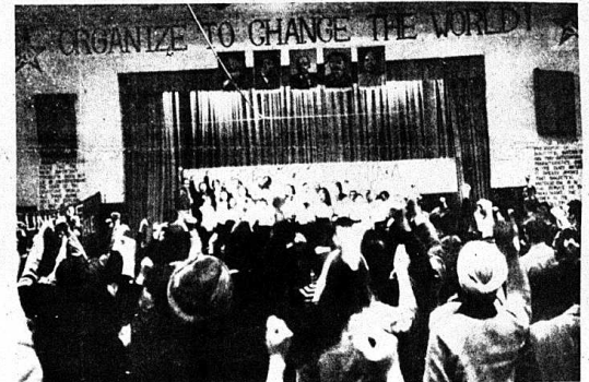
Within the last year thousands of people across Canada and Quebec, in the communities and universities, have participated in meetings and celebrations, attended photo exhibits and films on People's Republic of China, and have purchased Quotations from Chairman Mao-Tseung and other revolutionary works from China. The photo above shows FRIENDS OF CHINA rally in December 1969 in Vancouver, attended by 400 people to express their support for People's Republic of China.

Negotiations between representatives of the two governments had been going on since February, 1969, in Stockholm, Sweden. One key point in contention in the negotiations was over the question of Taiwan. The People's Republic of China has always maintained that Taiwan has historically been part of China and that it is presently an unliberated province under the fascist rule of the US imperialist puppet Chiang Kai-Shek. Prior to the mutual recognition, the