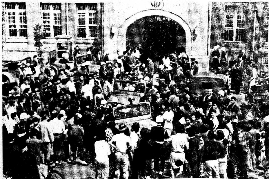
The bloody rule of U.S. imperialism and the Chiang bandit gang over the Taiwan people has aroused their irreplaceable hatred. On March 9, 1963, over 200 women in Shuangyuan, Taipei, rushed into the Taipei "City Government" and soundly beat up the chief secretary of the "City Government" and some policemen.