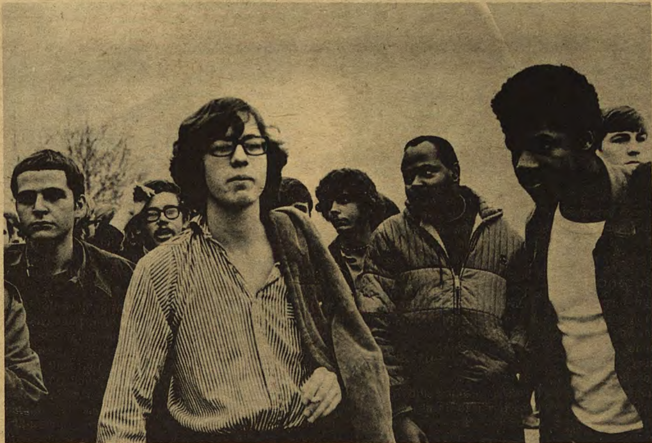
Holy Cross students kick scab GE recruiter off campus