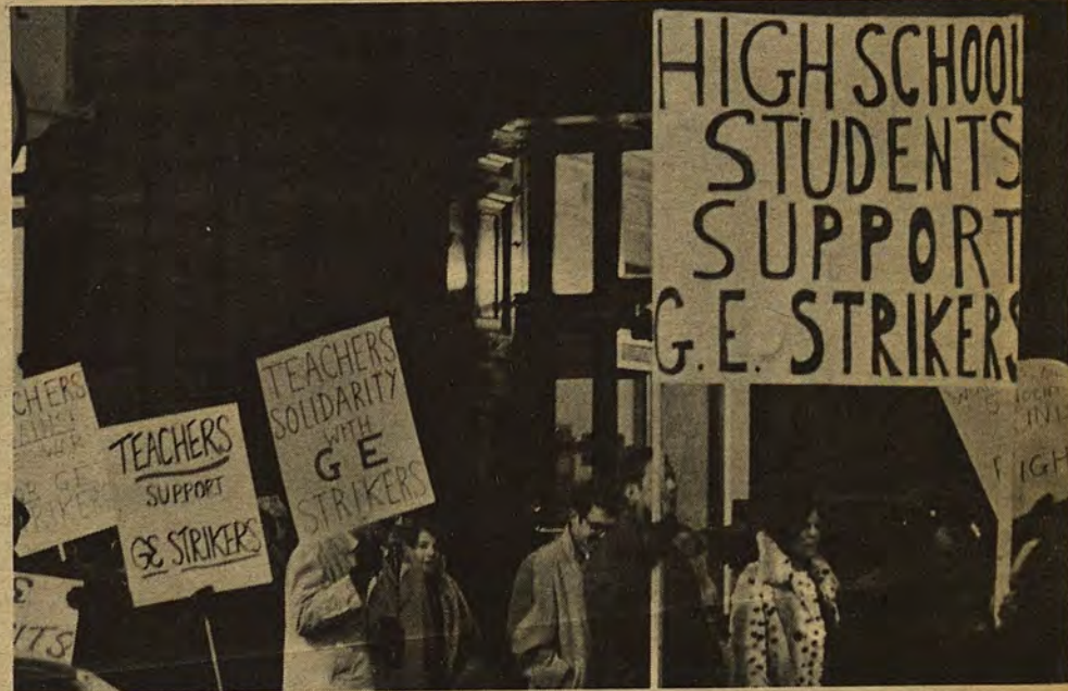
Boston--500 students, teachers, welfare workers and clients, and other workers march to support GE strikers