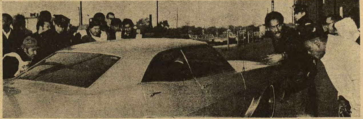
A car is checked and permitted to pass through picket line at General Electric Hotpoint division plant at 1538 S. 54th Av., Cicero.

GE, like all the big corporations in the US, has a big stake in the Vietnam war. Many of GE's foreign investments are in the Far East -- South Korea, Japan, Taiwan. They want desperately to insure the rest of Southeast Asia as a safe place for American investment. Why do the corporations place so much importance in foreign investment? $1.40 a day legal maximum wage