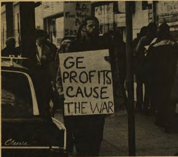
Chicago students boycott Hotpoint

The bosses claim that inflation is caused by high wages. This is a lie. Prices are high because corporations, in competition with each other, have to keep those profits rolling in. The truth is that GE's profits have been increasing at a record rate. Their need to maximize profits and to keep up immense war spending to protect the source of those profits is what causes inflation.