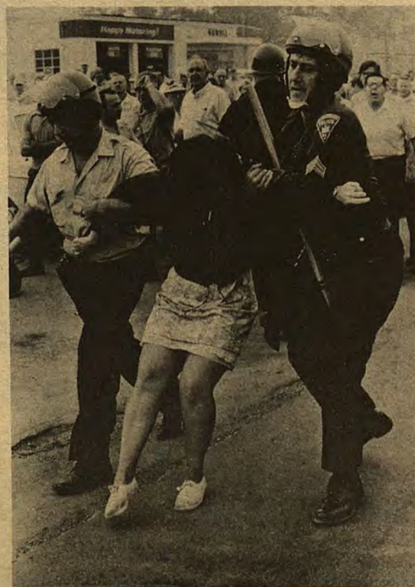
Cyanamid striker vs. cops

The US ruling class runs the educational system here, including colleges and universities. This means that, although they are often very subtle about it, they teach students all kinds of lies, distortions, and divisive ideas in the courses we take. Male chauvinism is part of this. Most importantly: (1) students are taught to disregard the oppression of women workers (and, of course, all workers, especially black); and (2) we are taught that women in general, including women students, are mainly for the pleas-