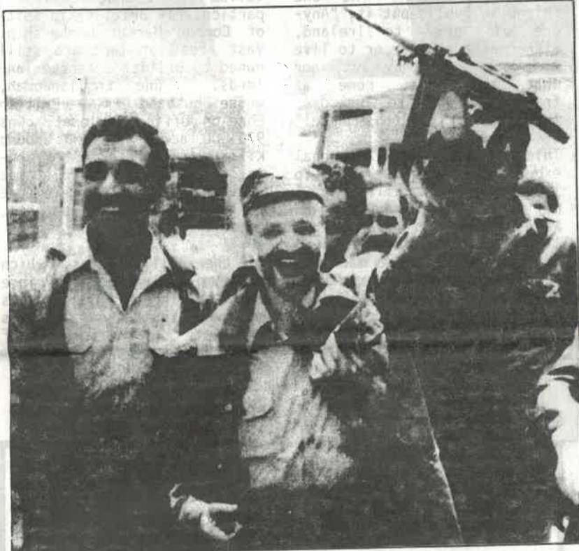
PLO Chairman Yasser Arafat tours the front line and meets Palestinian fighters defending the southern approaches to the city. Two days earlier, Israel's Chief of Staff claimed the Palestinian leader had taken refuge in a foreign embassy.

“They are trying to wipe out the Palestinians as a nation”