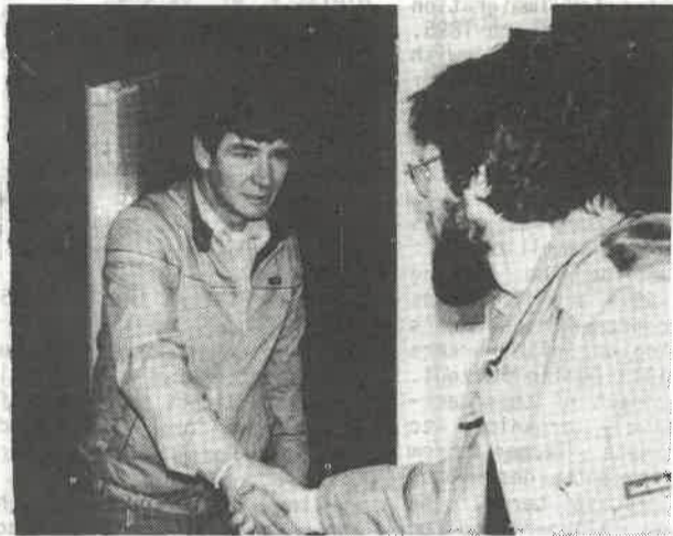
Gerry Adams on the campaign trail in Unity Flats.

rights, repression and violence. If you support this view, then you support Sinn Fein."