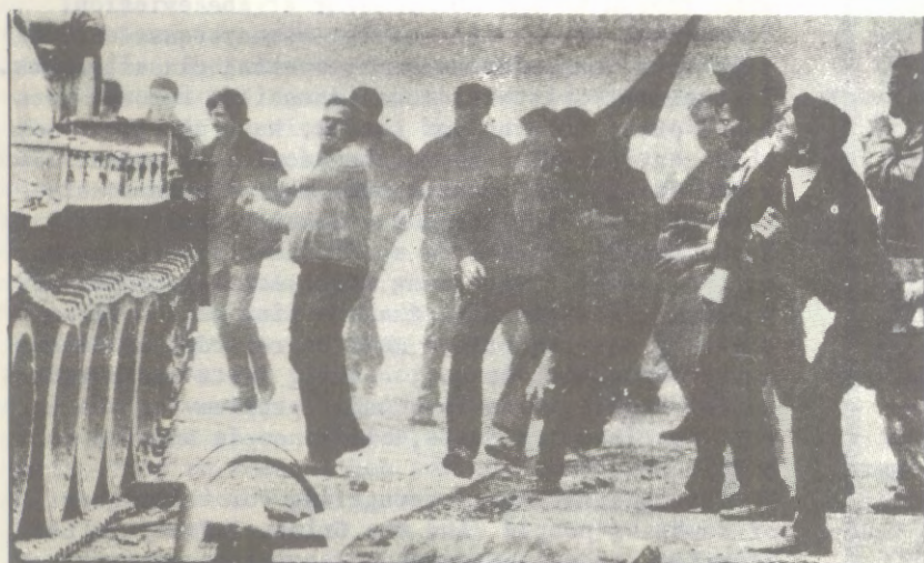
Prague 1968: Demonstrators stone Soviet tanks.

The imperialist relationship continued after the invasion. In 1975 alone, Czechoslovakia was forced to divert 16% of its capital construction funds and sent 6000 skilled workers to build a Soviet gas Cont'd on p6