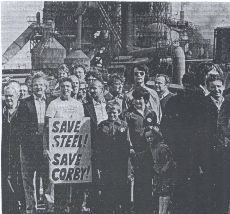
The workers of Corby demonstrate to protect their livelihood as part of the overall community campaign to save the Corby Steelworks. See page 4

THE TORIES announce the removal of all remaining restrictions on currency exchange controls. Labour blathers about 'confusion of priorities'. We conclude however, that, on the contrary, the Tories prove once again that their priorities are crystal clear. Their objective is the absolute subjugation of British economy to the needs of finance capital in search of the highest rate of profit.