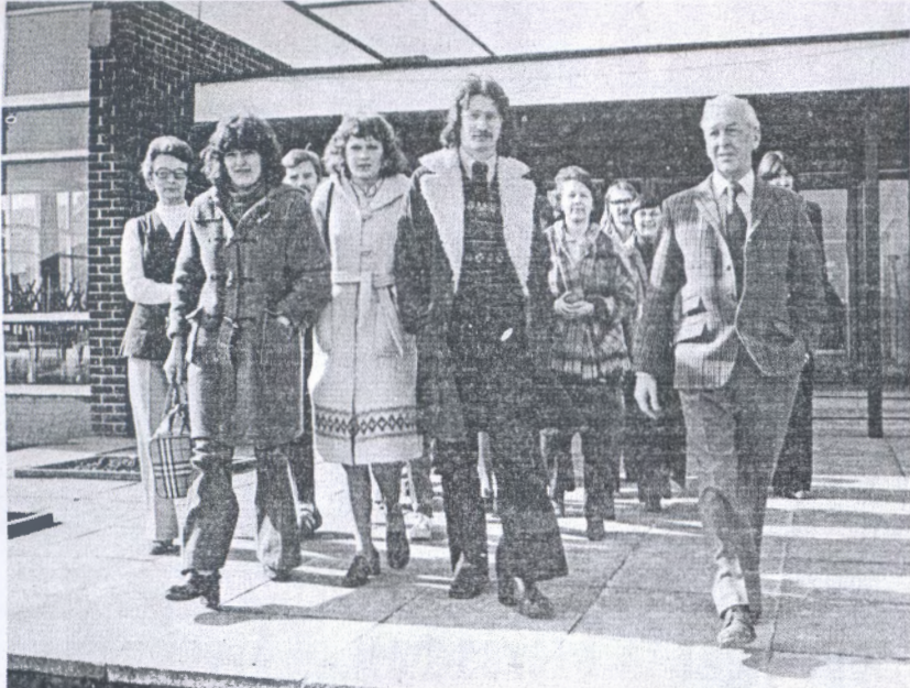
Teachers of Cheviot Middle School, Newcastle upon Tyne, leaving the school at lunch time in connection with the sanctions being imposed to back their pay claim. The teachers' work-to-rule has had such a powerful effect that the employers are falling over themselves to withdraw with dignity.