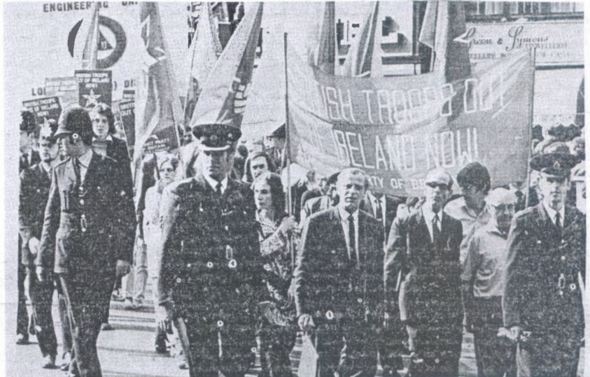
The 1916 Easter Uprising challenged British Imperialism in Ireland. From its inception the CPB(ML) has demanded "British Troops out of Ireland". Photo shows an early CPB(ML) demonstration in support of this demand.

The main support for the agreement is coming from the British government. Dr Owen has given a de facto blessing by first refusing to condemn it and then by inviting the three black signatories to address the UN on behalf of Smith.