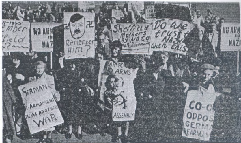
In 1954 when the US and British Governments wanted to re-arm Germany as an anti-communist force, the people of Britain were opposed. Picture shows the people of Scarborough demonstrating outside the Labour Party conference.

Independence is vital to NALGO and all trade unions. Resistance to 'industrial democracy' should form a uniting link for all shades of opinion.