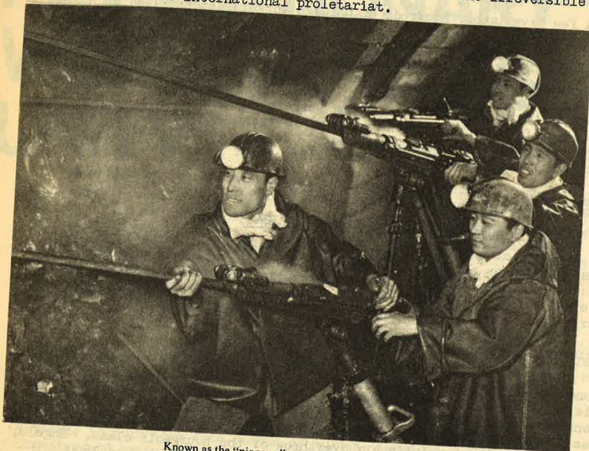
Known as the "pioneers", members of the youth shock brigade, Chaokochuang mine, at work.

people will be celebrating national liberation, victory over U.S. imperialism, and the reunification of their nation. In Vietnam, the imperialists and their reactionary lackeys are crumbling before the steady advance of the revolutionary forces - Asia, Africa and Latin America are ablaze with the fires of national liberation movements. Around the world, millions will rejoice at these victories and pledge to continue the irreversible forward march of the international proletariat.