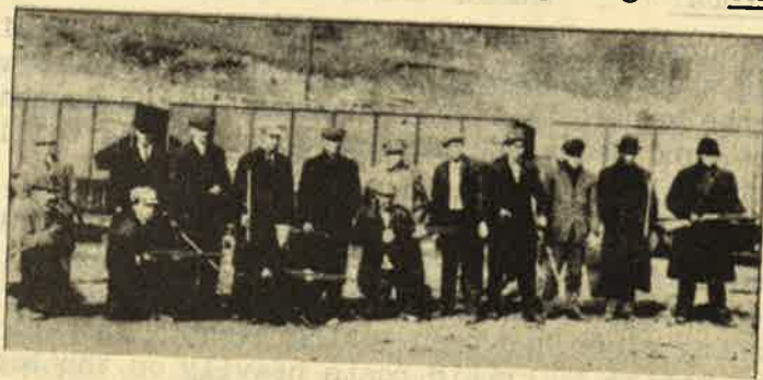
STRIKING AMERICAN MINERS TOOK UP ARMS DURING THE DEPRESSION

As the workers and communist movements grew, May Day quickly developed beyond the demand for the 8-hour day. It developed toward becoming what it is today - a day of mobilization for struggle against capitalism, a demonstration of the unity and strength of the international working class in its struggle to destroy the class distinctions of the capitalist system through the revolutionary overthrow of the bourgeois class. Engels, speaking about the first international May Day demonstration in 1890, called it the proletariat's "review of its forces"..."mobilized for the first time as one army, under one flag and fighting for one aim."