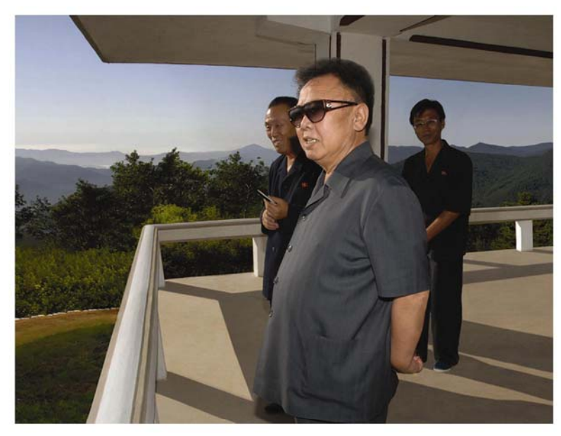
At the goat farm on the Phyongphung Tableland in Hamju County (August 7, 2008)