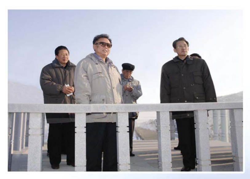
At the construction site of the Samsu Power Station (March 3, 2006)