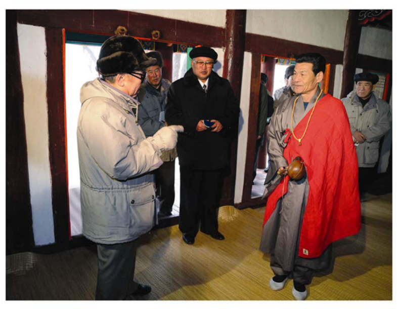
At the Pobun Hermitage in Mt. Ryongak (January 17, 2009)