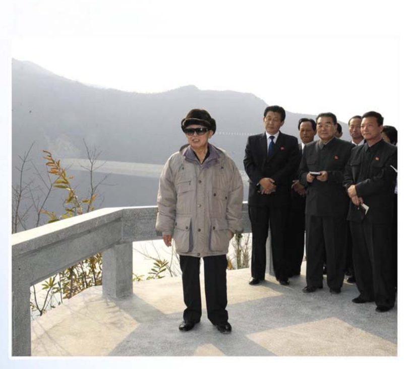
At the Kumjingang Kuchang Youth Power Station (November 6, 2009)