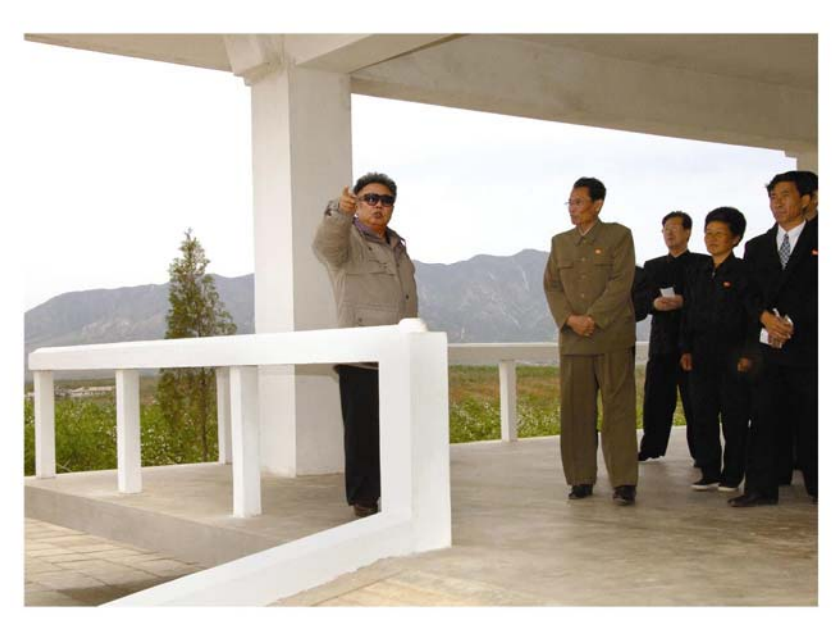
At the Kosan Fruit Farm (May 4, 2008)