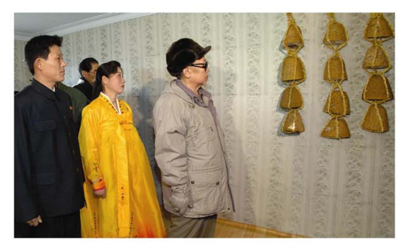
With a newly-wed couple of discharged soldiers at the Wonsan Youth Power Station (January 5, 2009)