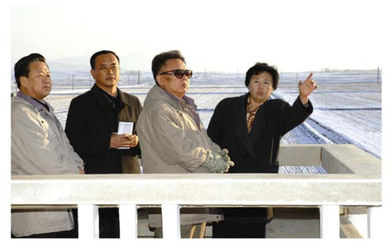
At the Migok Cooperative Farm in Sariwon (December 3, 2006)