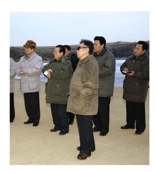
In a fish farm at Lake Jangyon (February 6, 2007)