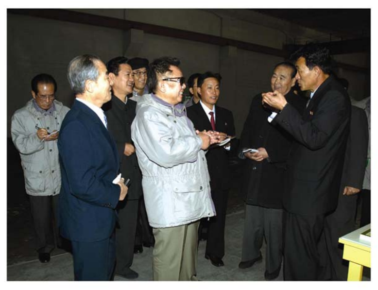
At the Ryongsong Machine Complex (November 12, 2006)