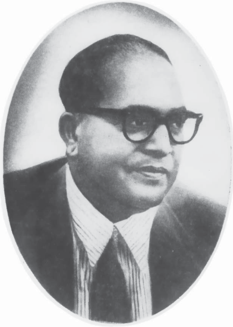
Babasaheb Dr. B.R. Ambedkar (14th April 1891 - 6th December 1956)